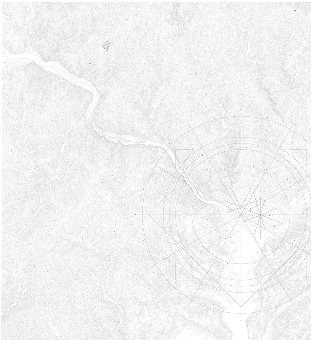
One and Another State of Yellow – Washington, DC – Overview Map